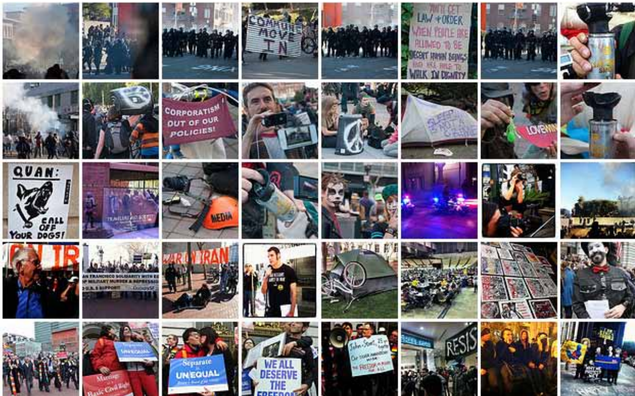
Flickr photo essay/slide show was prepared by Oakland photographer Steve Rhodes.

Then we spoke about awakening out of our conditioned identity as a separate, disconnected 3-dimensional individual and awakening into our natural state – the unconditioned, boundless, spontaneously beneficent awareness of now. This clear open presence can be recognized by stopping thought for a moment and just notice the open, knowing quality of being that is here. Then, we can recognize it again and again; short moments, repeated many times become continuous. If we choose to rely on short moments, gradually, we will discover that all of our data streams (thoughts, emotions, sensations, experiences) are permeated by this ever-present, clear intelligence which is spontaneously beneficial.