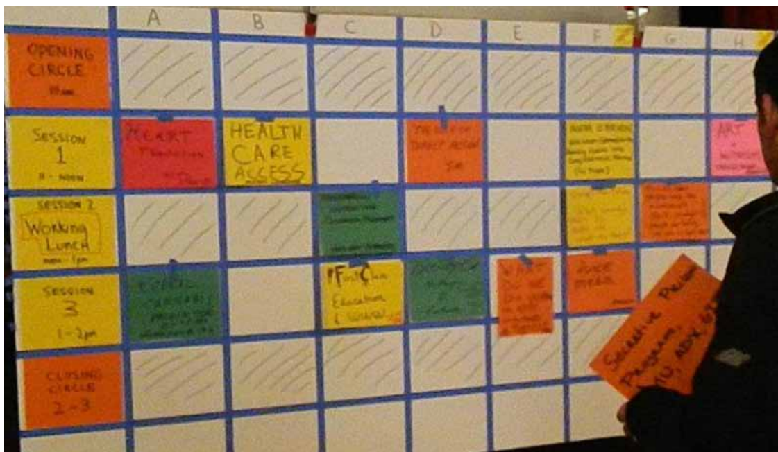
Sunday's topic postings

* note: not all convened sessions received notes back and/or were videoed